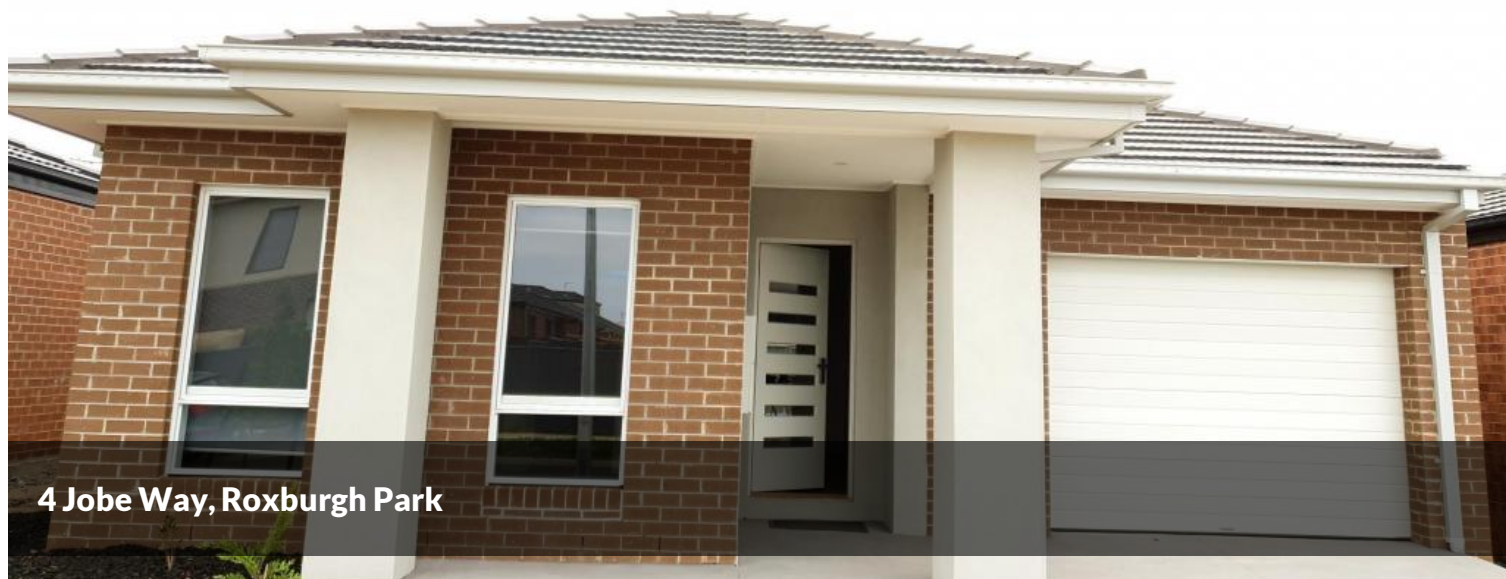
4 Jobe Way, Roxburgh Park