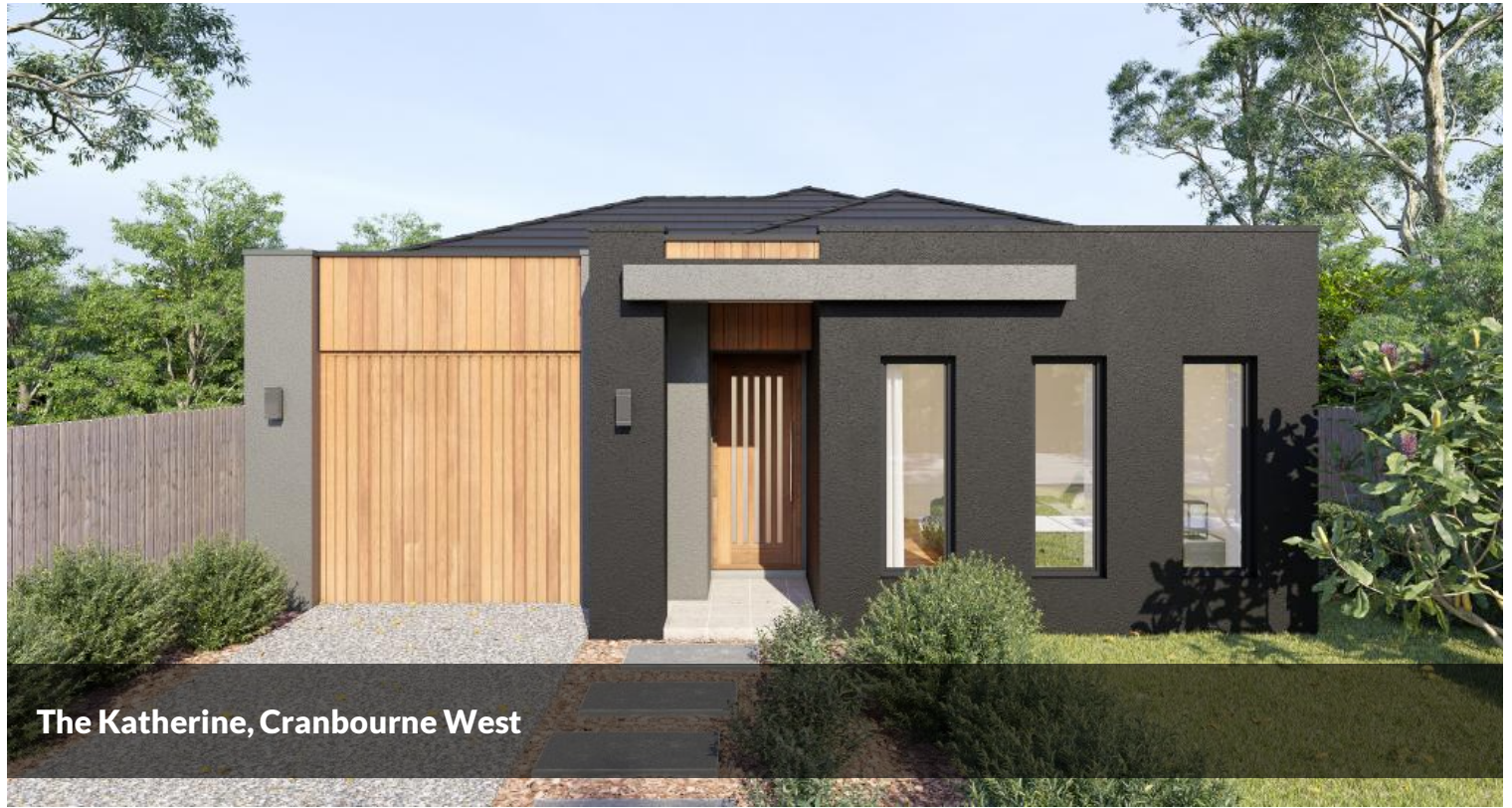
The Katherine, Cranbourne West