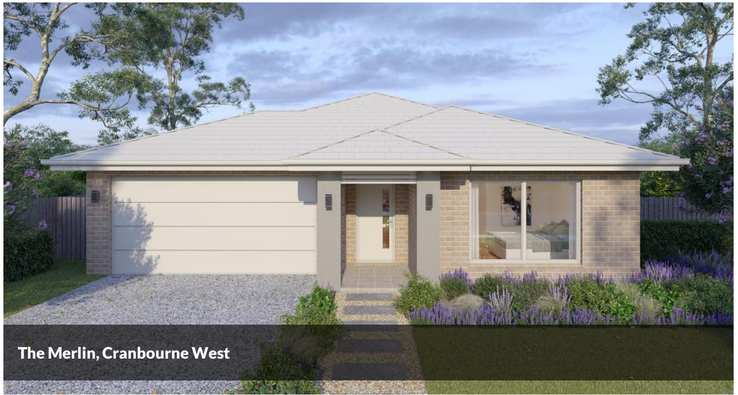
The Merlin, Cranbourne West