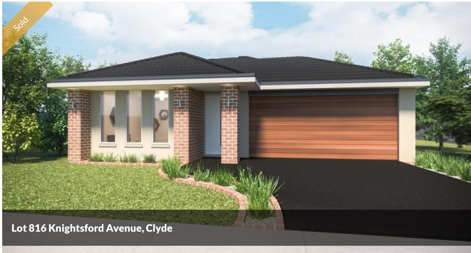
Lot 816 Knightsford Avenue, Clyde