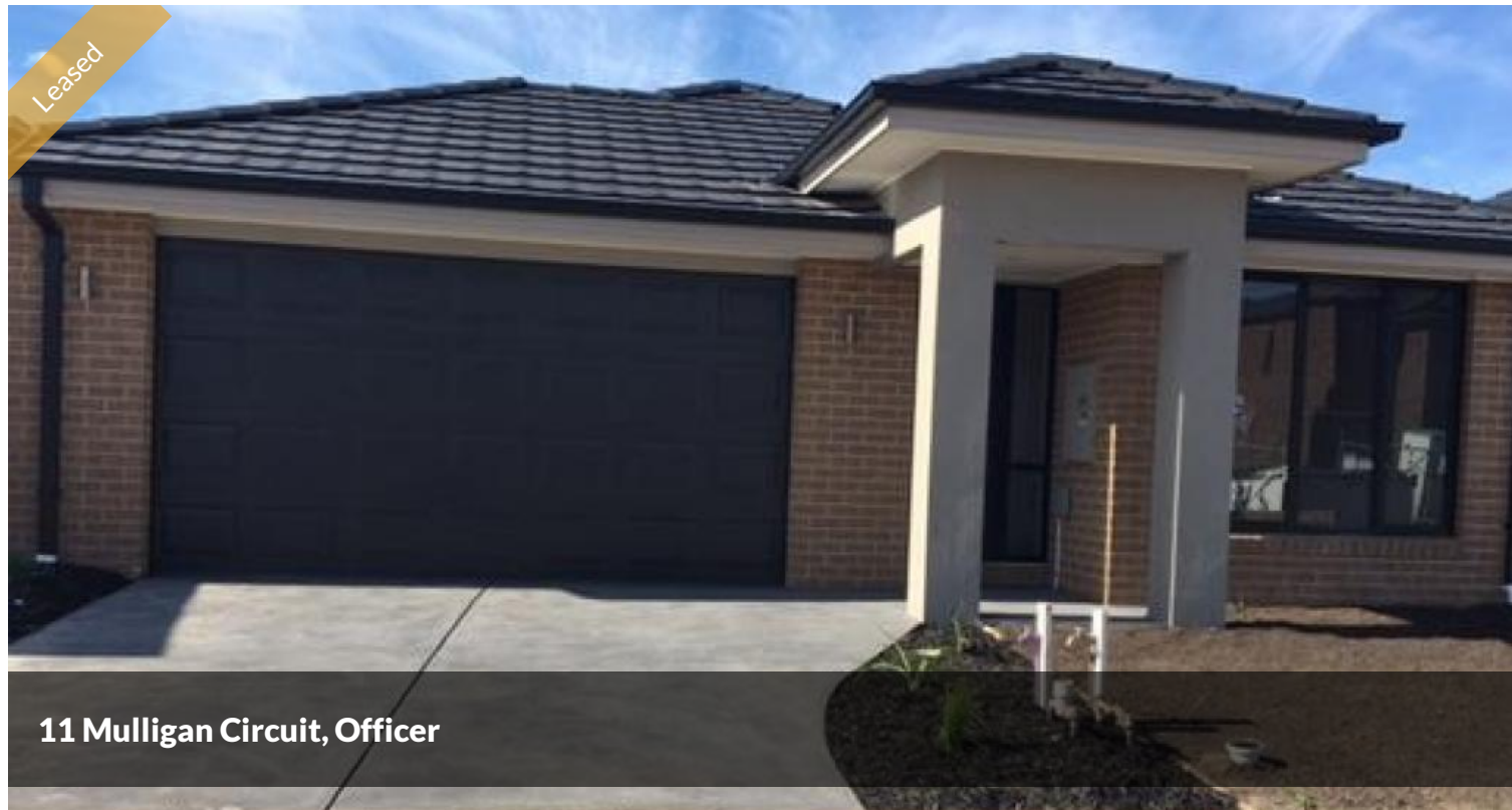
11 Mulligan Circuit, Officer