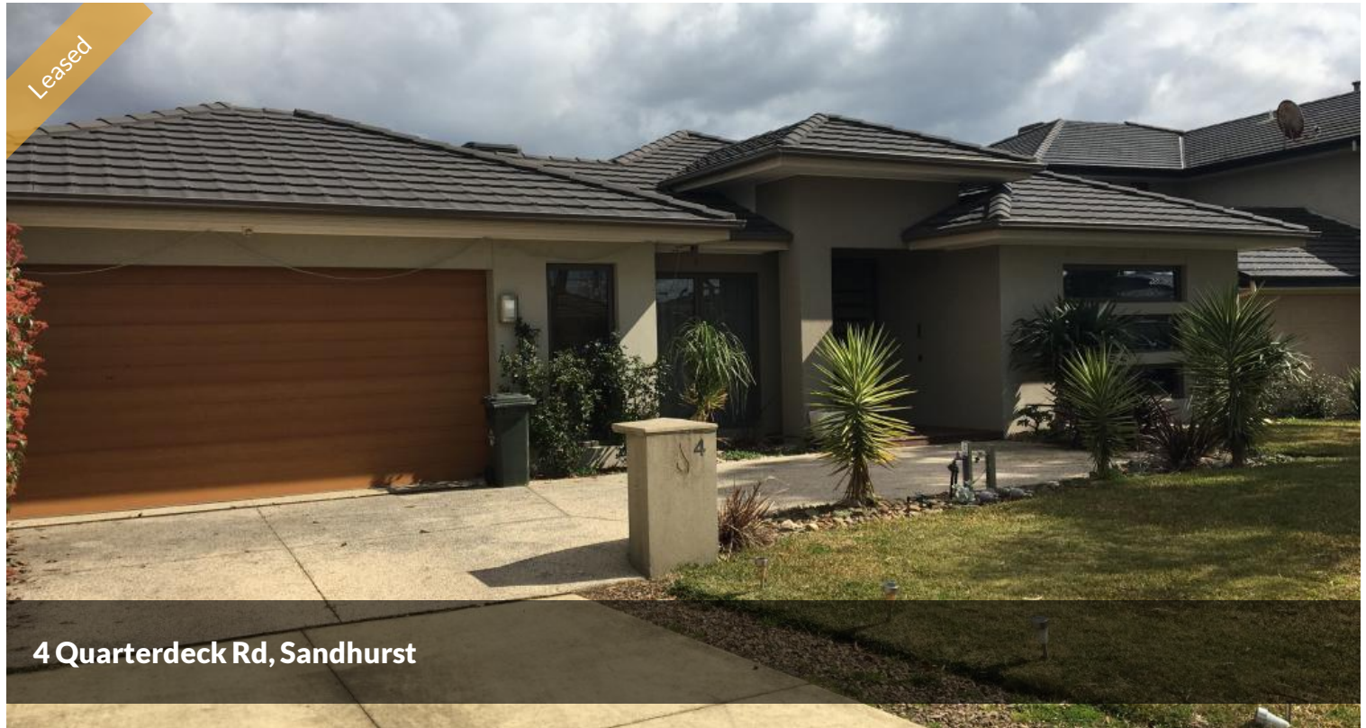
4 Quarterdeck Rd, Sandhurst