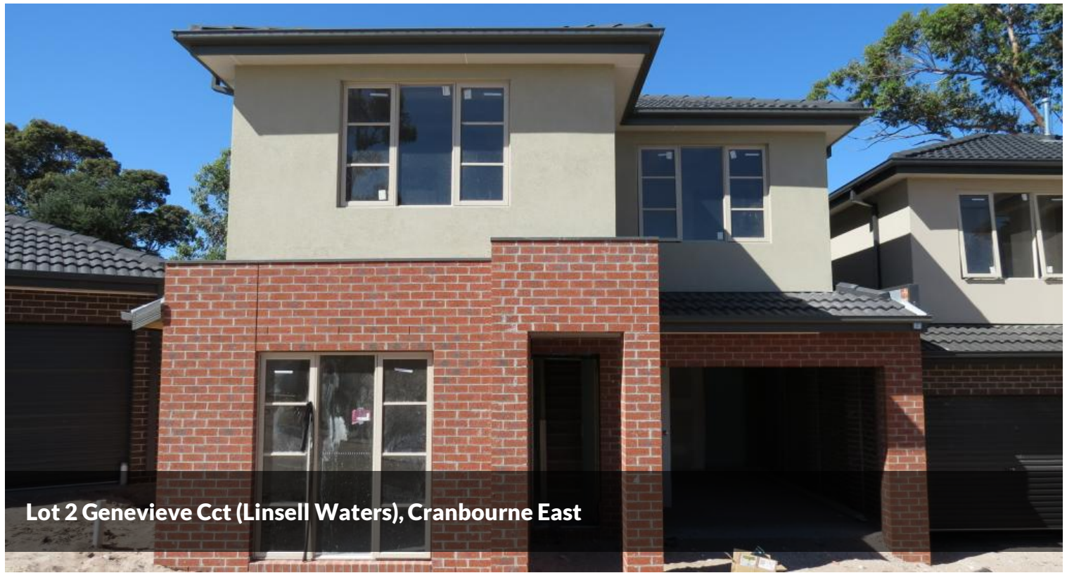
Lot 2 Genevieve Cct (Linsell Waters), Cranbourne East