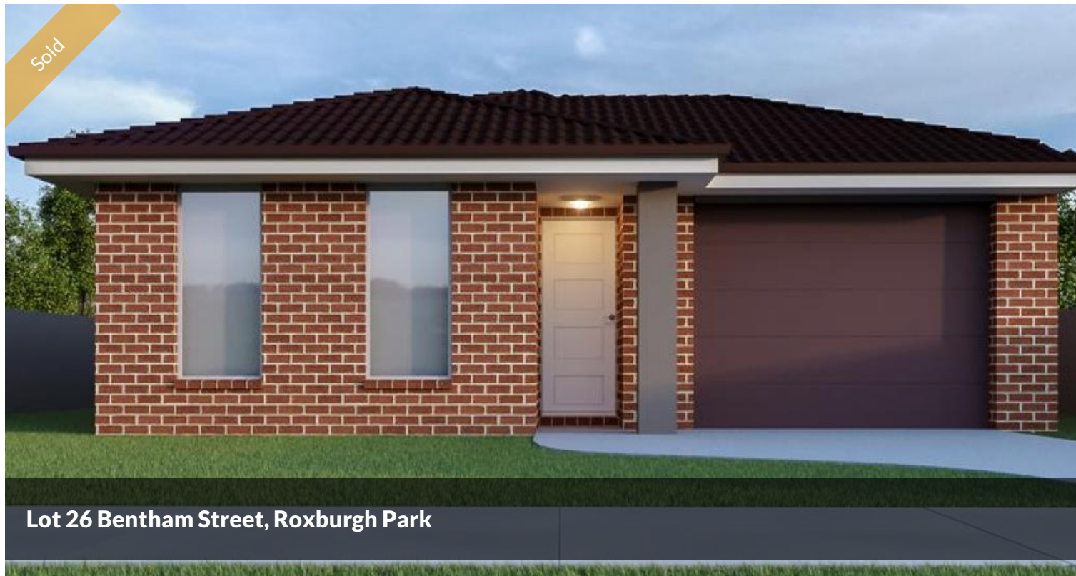
Lot 26 Bentham Street, Roxburgh Park