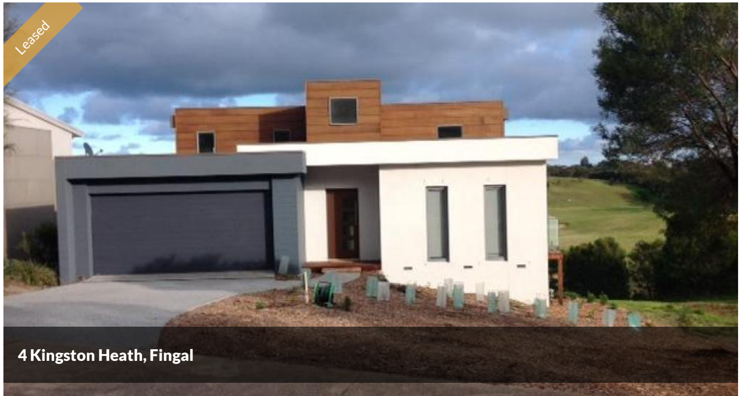
4 Kingston Heath, Fingal