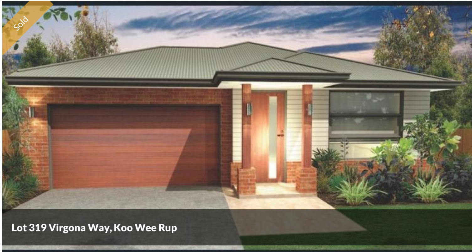
Lot 319 Virgona Way, Koo Wee Rup