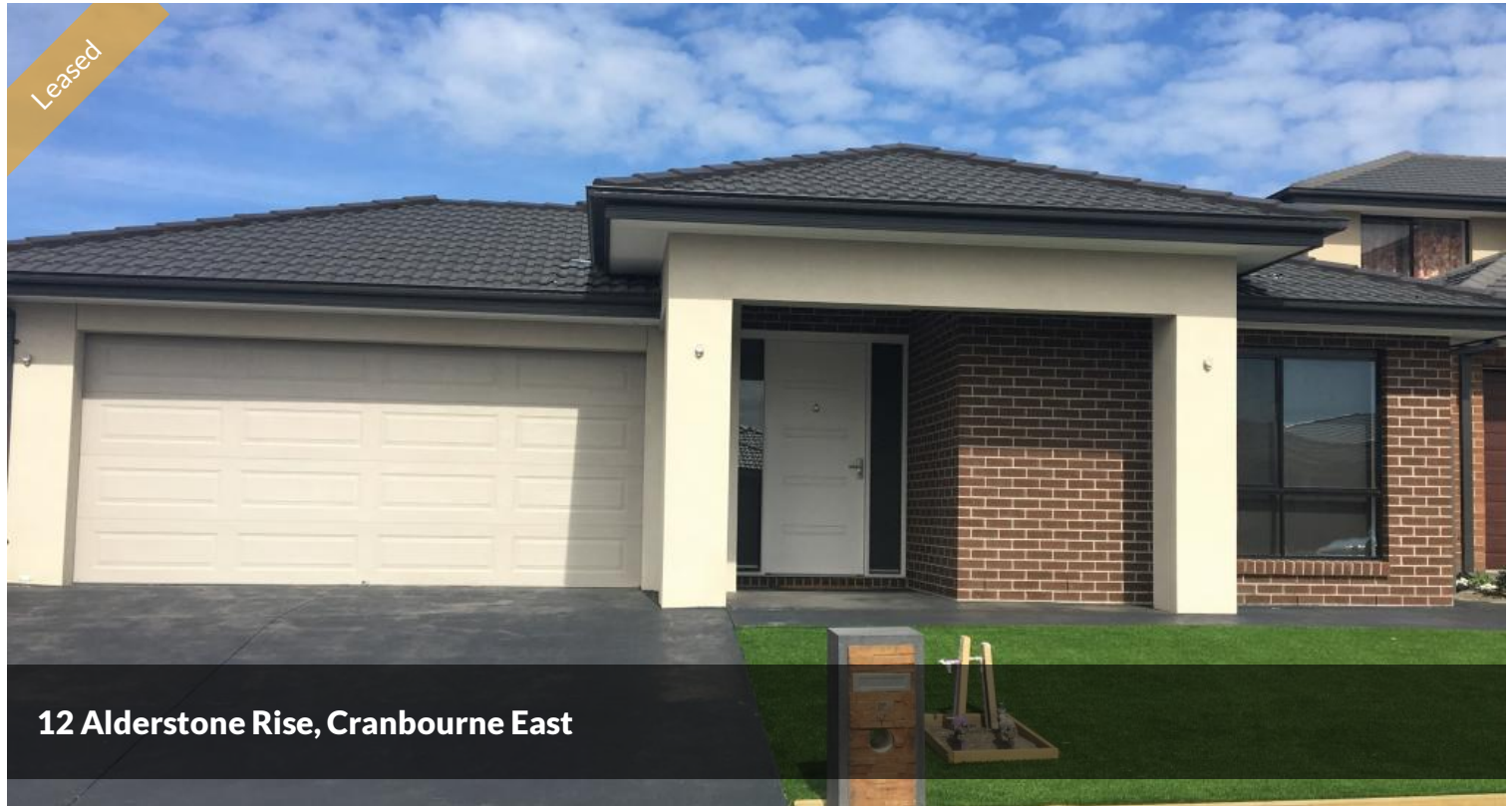
12 Alderstone Rise, Cranbourne East