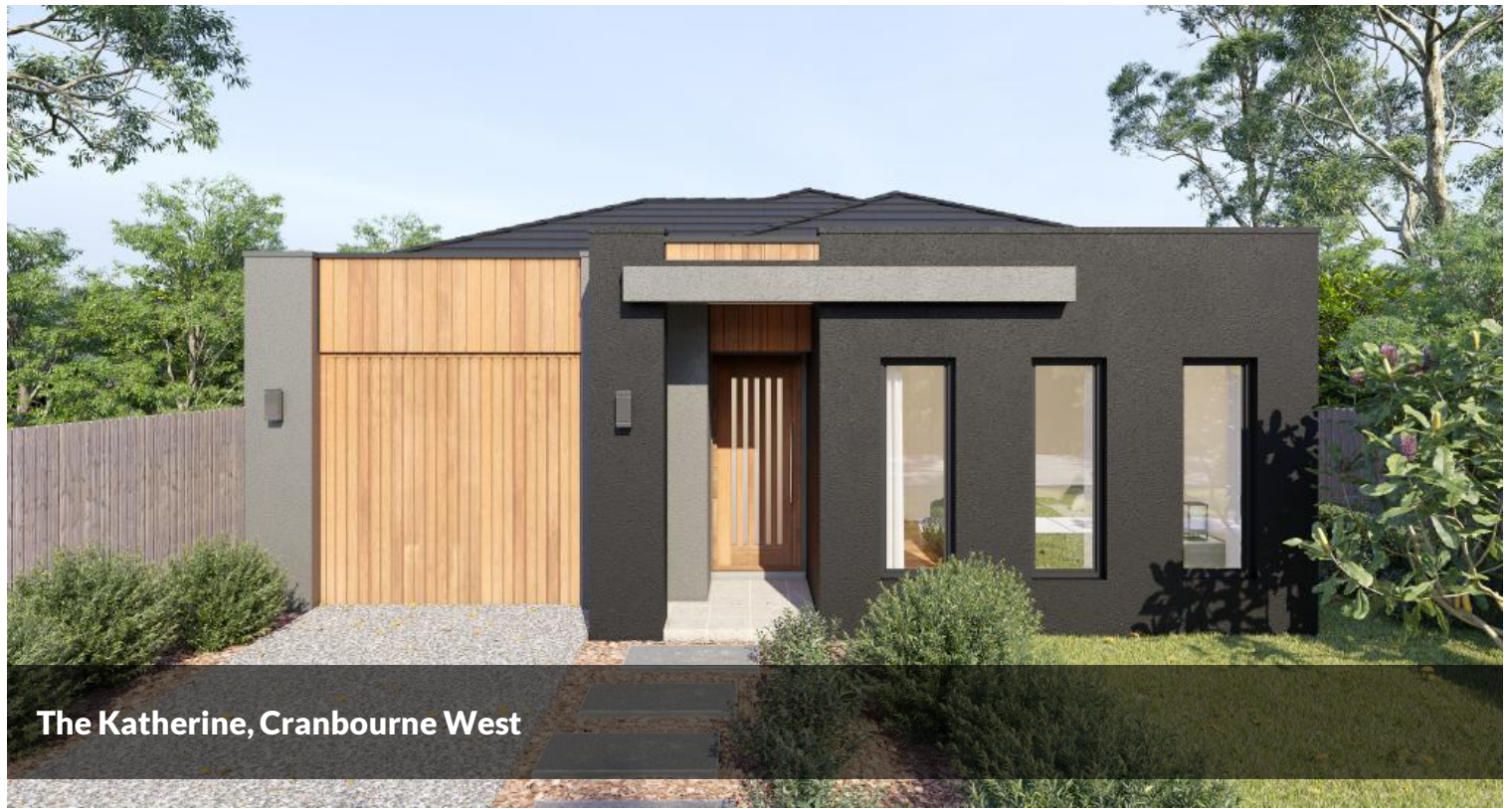
The Katherine, Cranbourne West