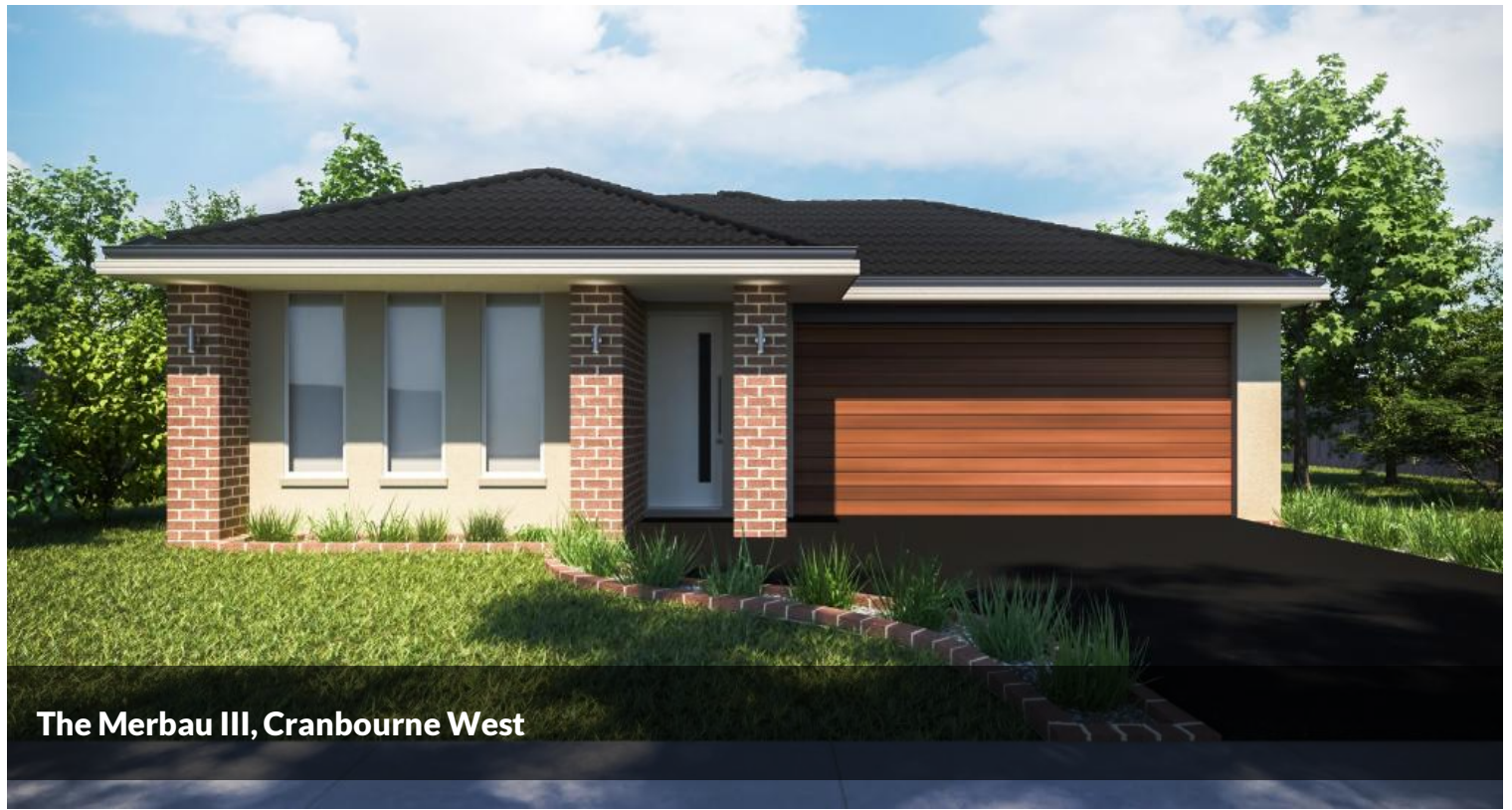
The Merbau III, Cranbourne West