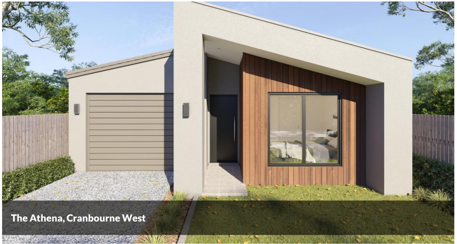
The Athena, Cranbourne West