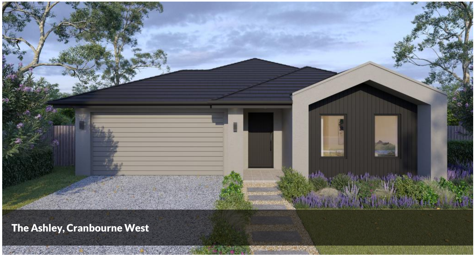
The Ashley, Cranbourne West