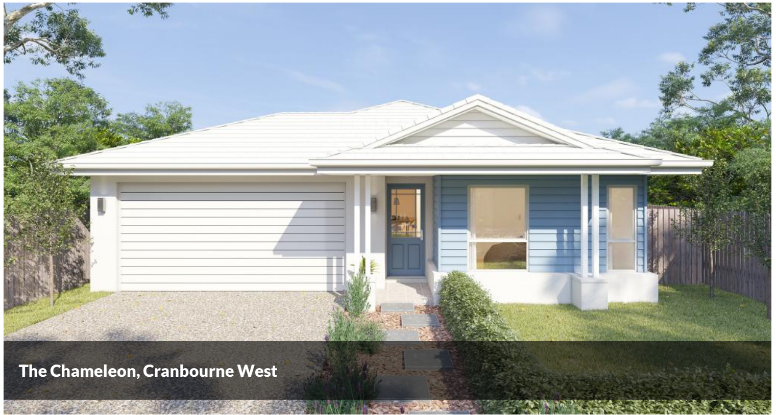
The Chameleon, Cranbourne West