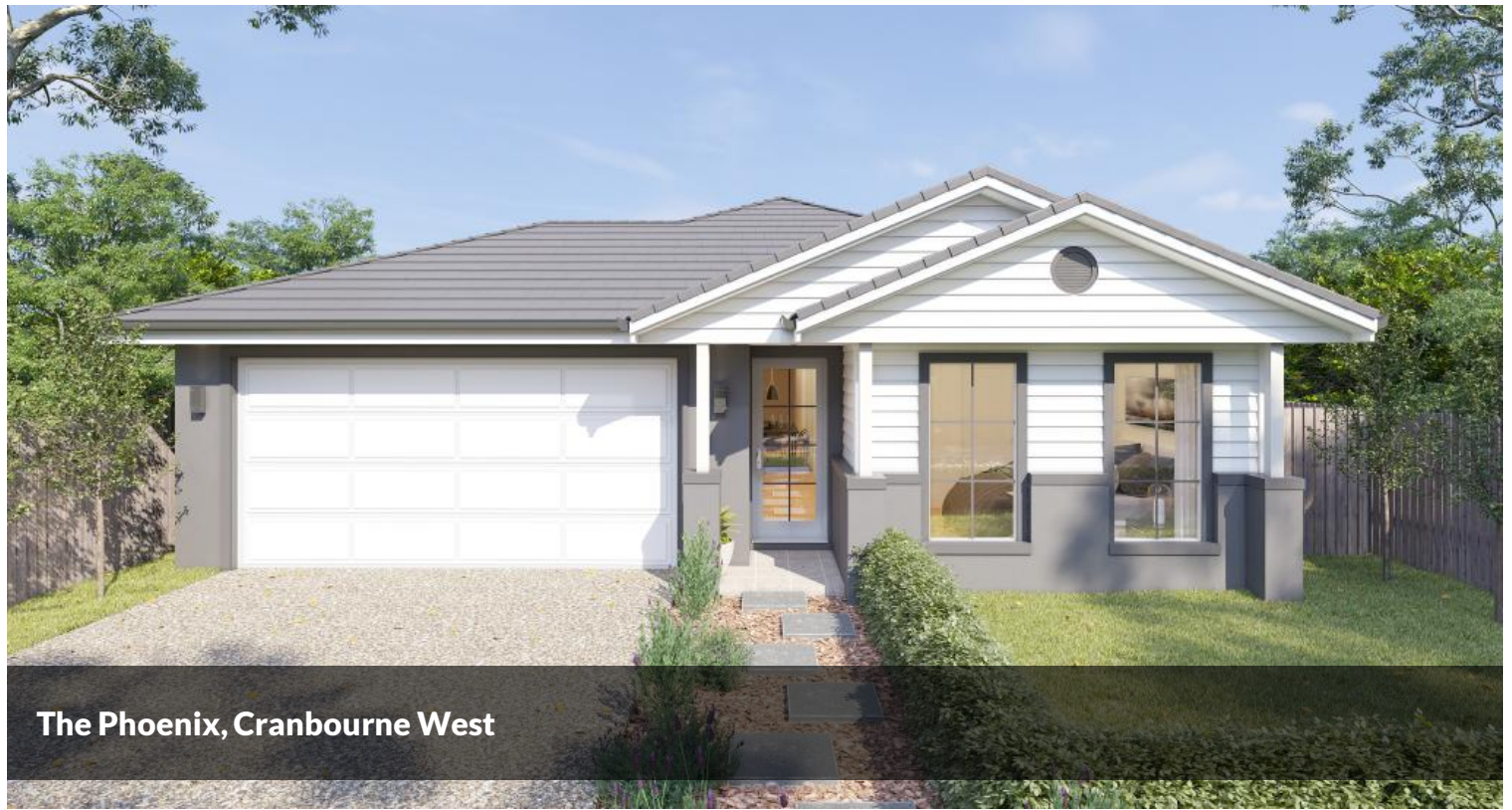
The Phoenix, Cranbourne West