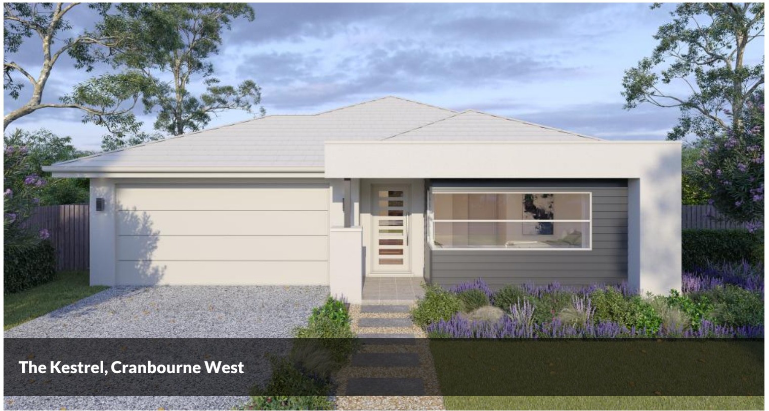
The Kestrel, Cranbourne West