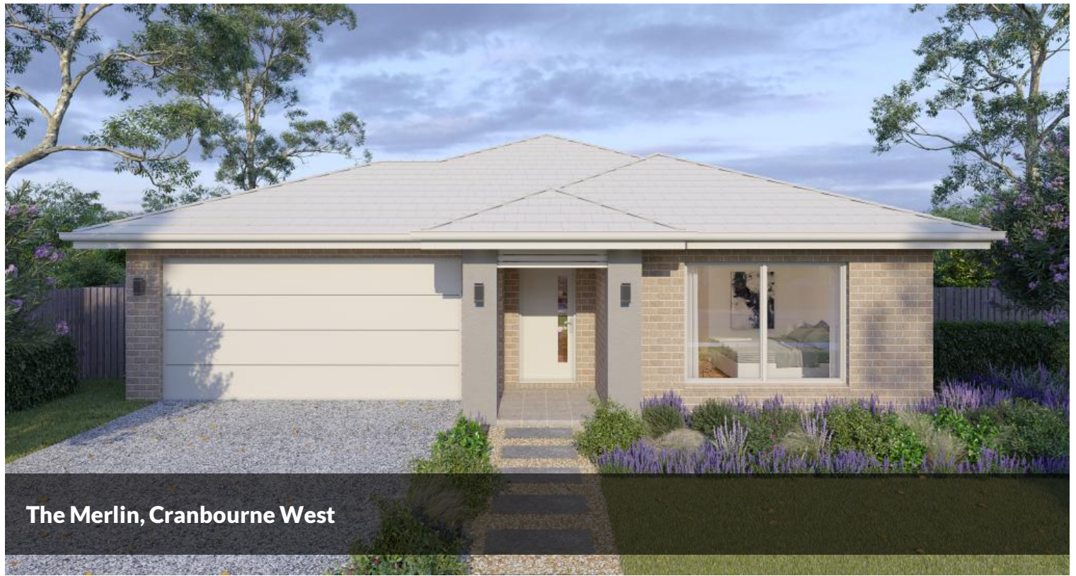
The Merlin, Cranbourne West