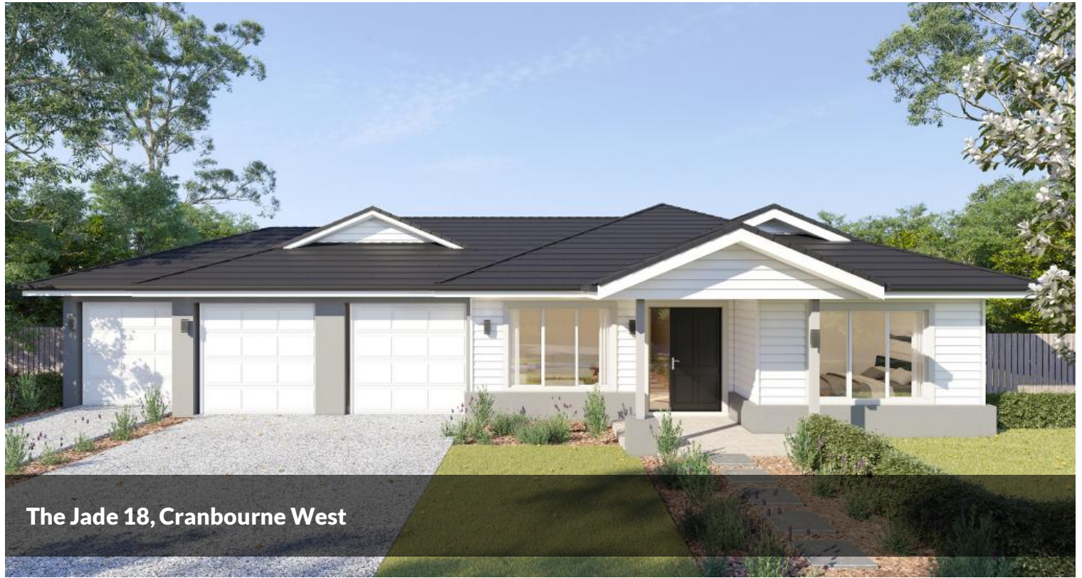
The Jade 18, Cranbourne West