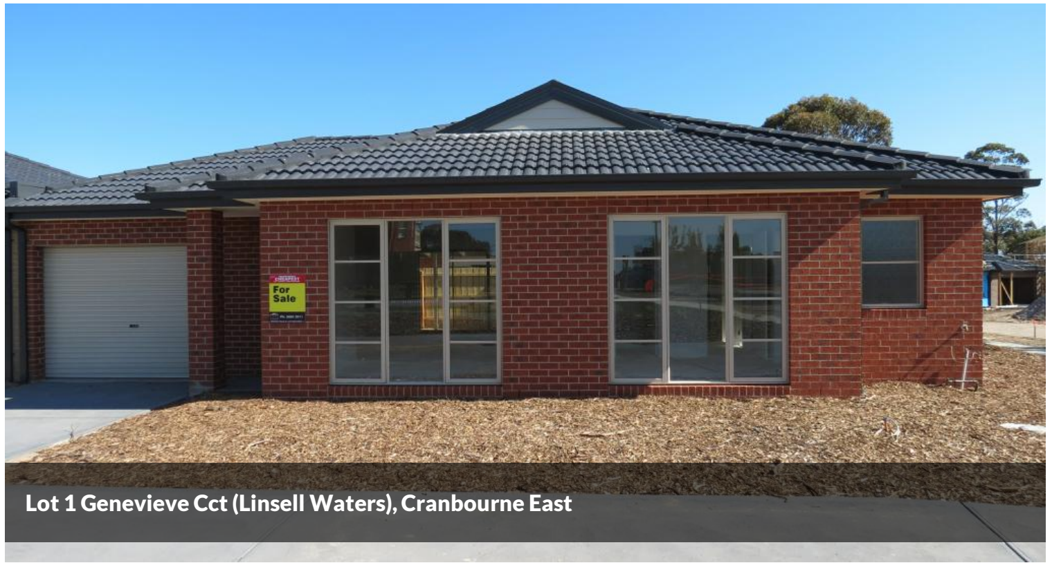
Lot 1 Genevieve Cct (Linsell Waters), Cranbourne East