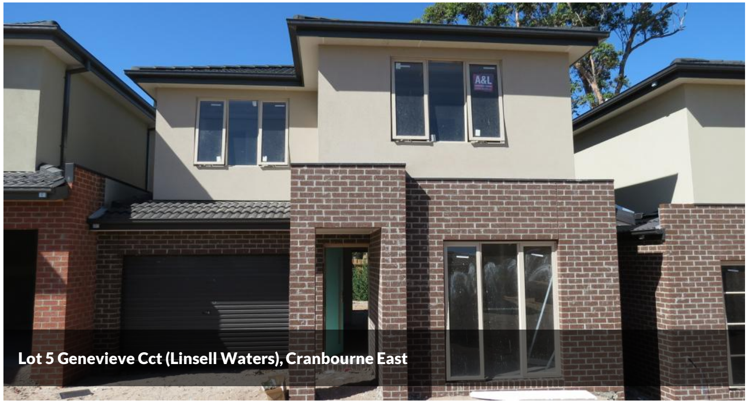
Lot 5 Genevieve Cct (Linsell Waters), Cranbourne East