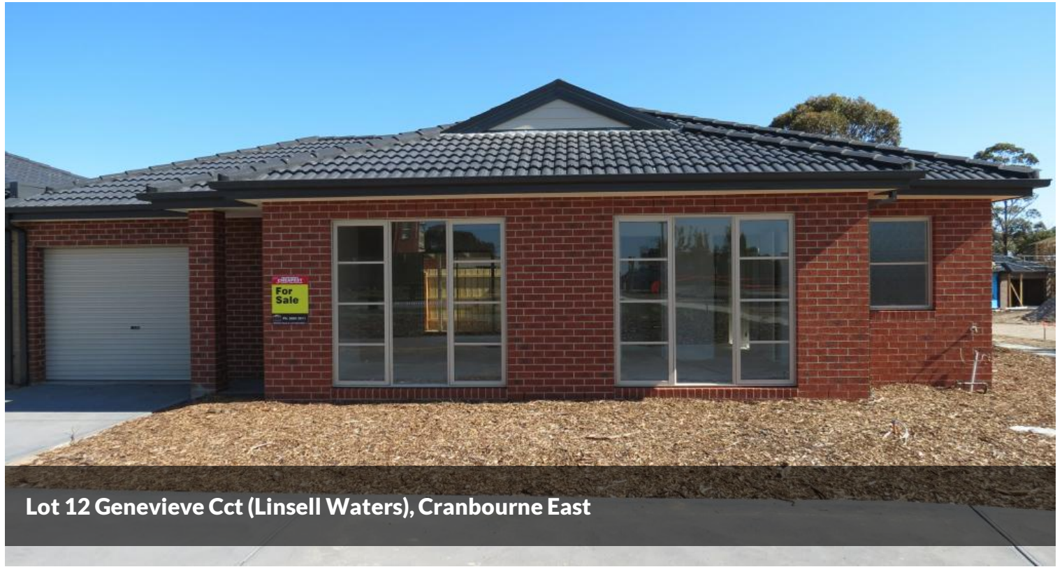
Lot 12 Genevieve Cct (Linsell Waters), Cranbourne East