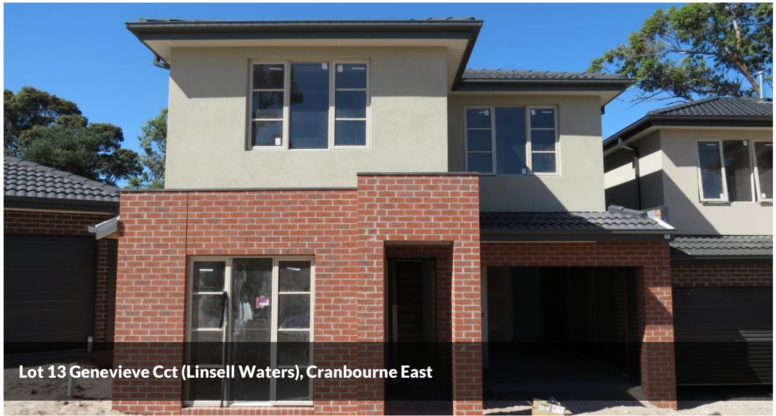
Lot 13 Genevieve Cct (Linsell Waters), Cranbourne East