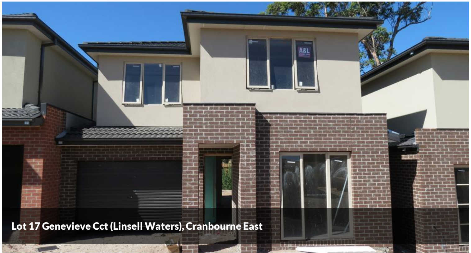
Lot 17 Genevieve Cct (Linsell Waters), Cranbourne East