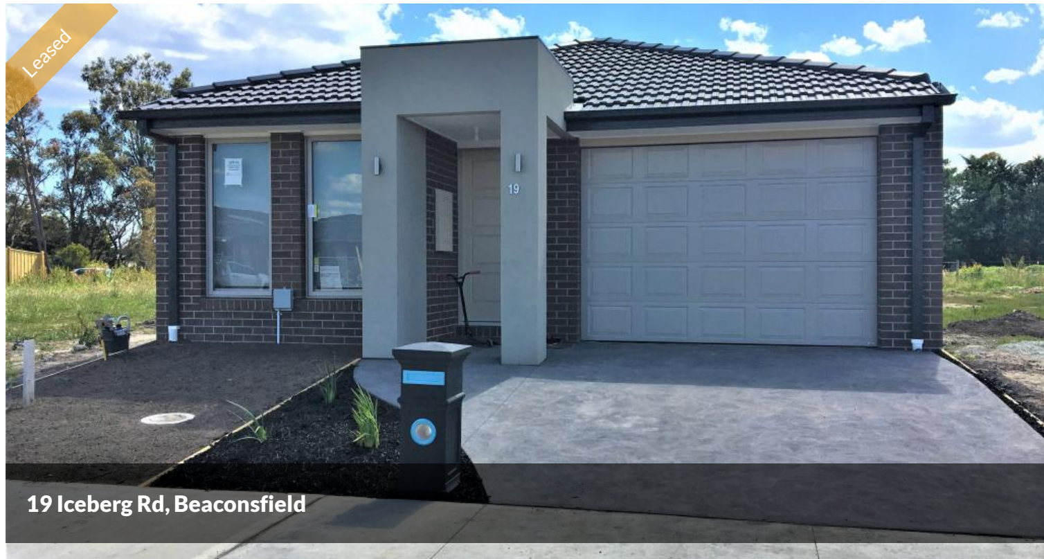
19 Iceberg Rd, Beaconsfield