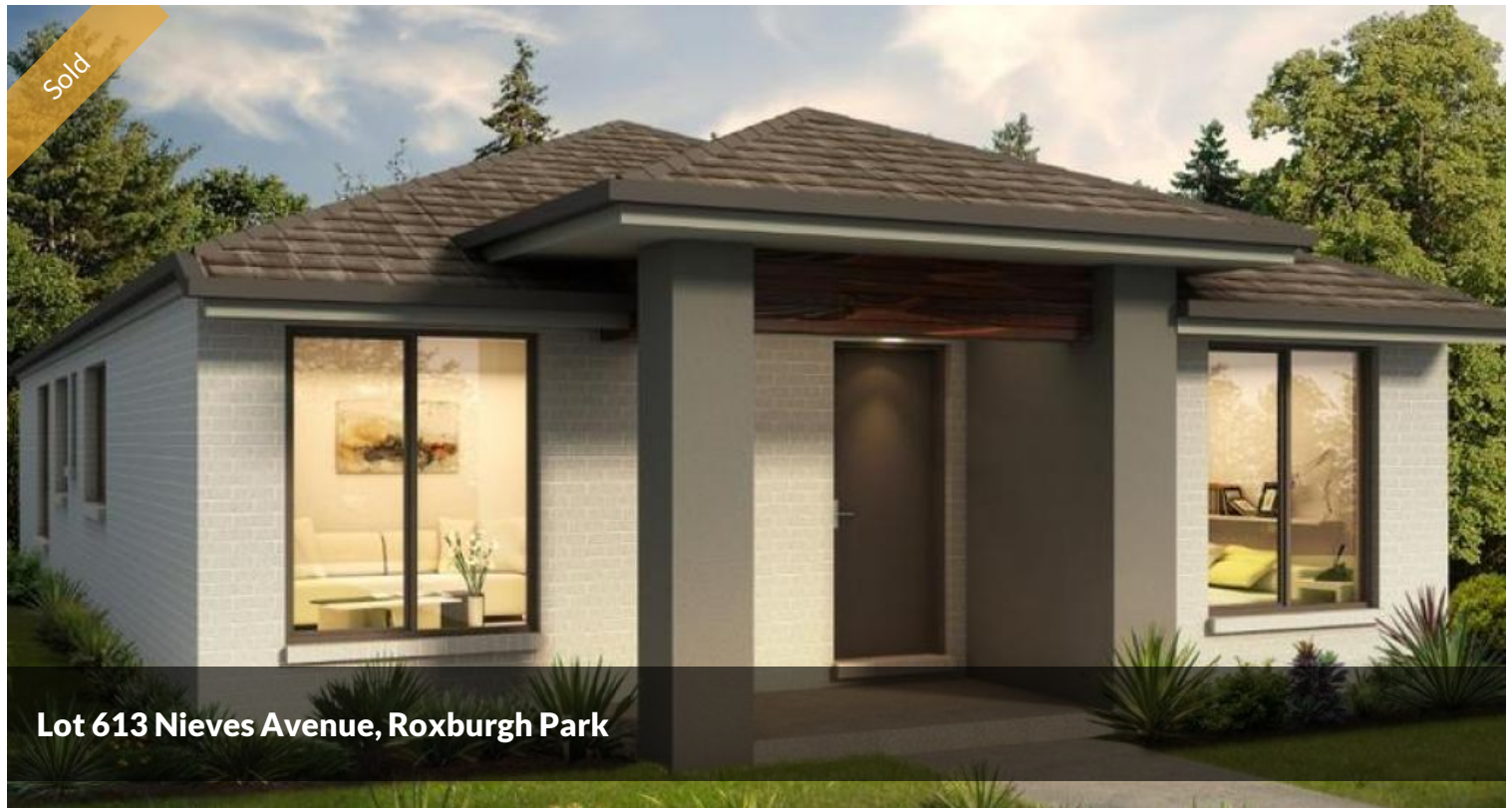
Lot 613 Nieves Avenue, Roxburgh Park