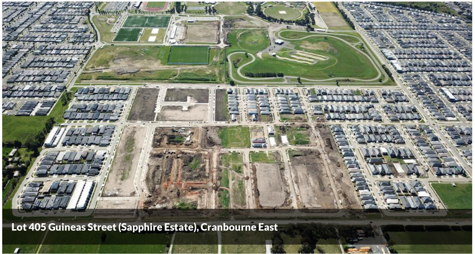
Lot 405 Guineas Street (Sapphire Estate), Cranbourne East