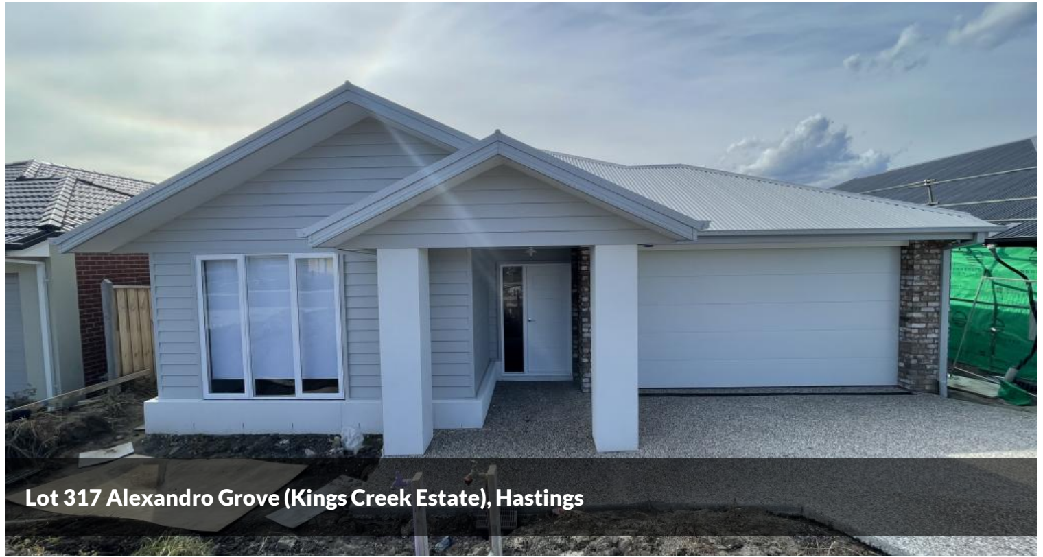
Lot 317 Alexandro Grove (Kings Creek Estate), Hastings