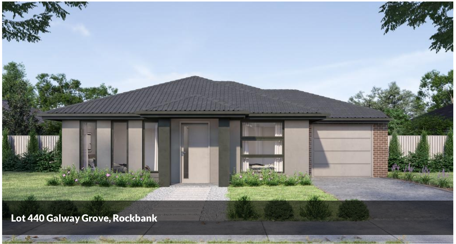
Lot 440 Galway Grove, Rockbank