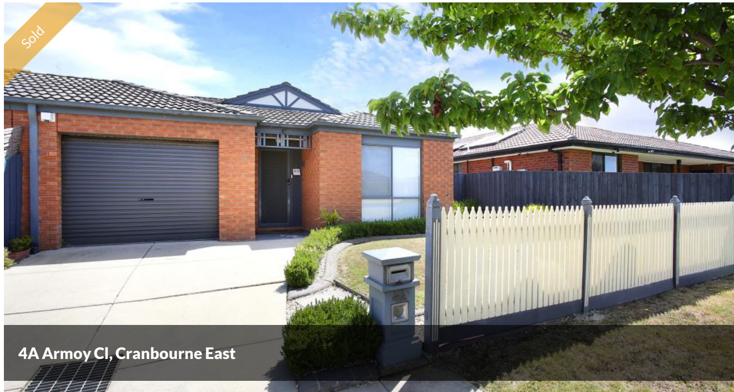
4A Armoy Cl, Cranbourne East