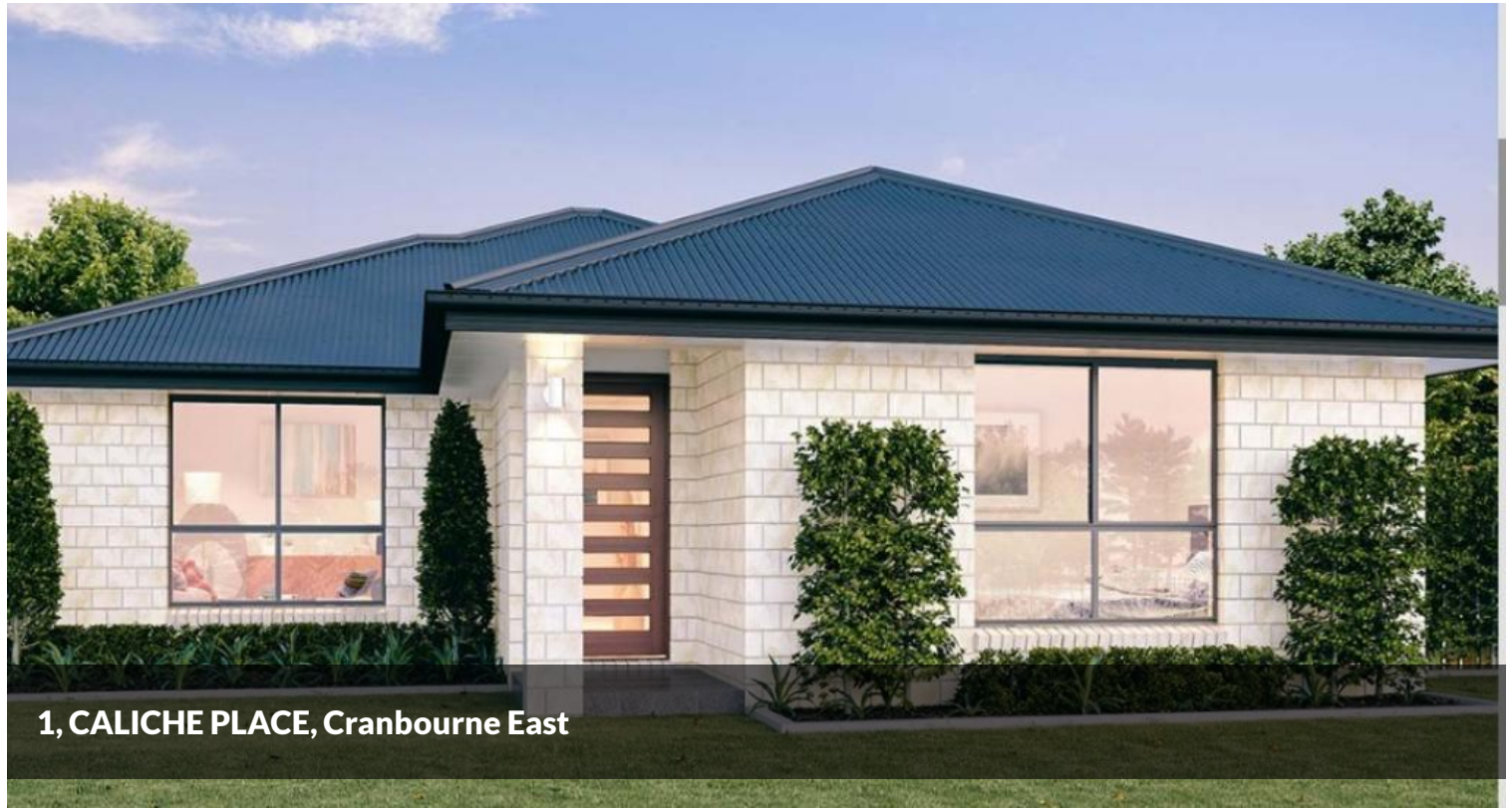
1, CALICHE PLACE, Cranbourne East