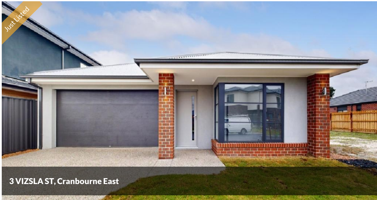
3 VIZSLA ST, Cranbourne East