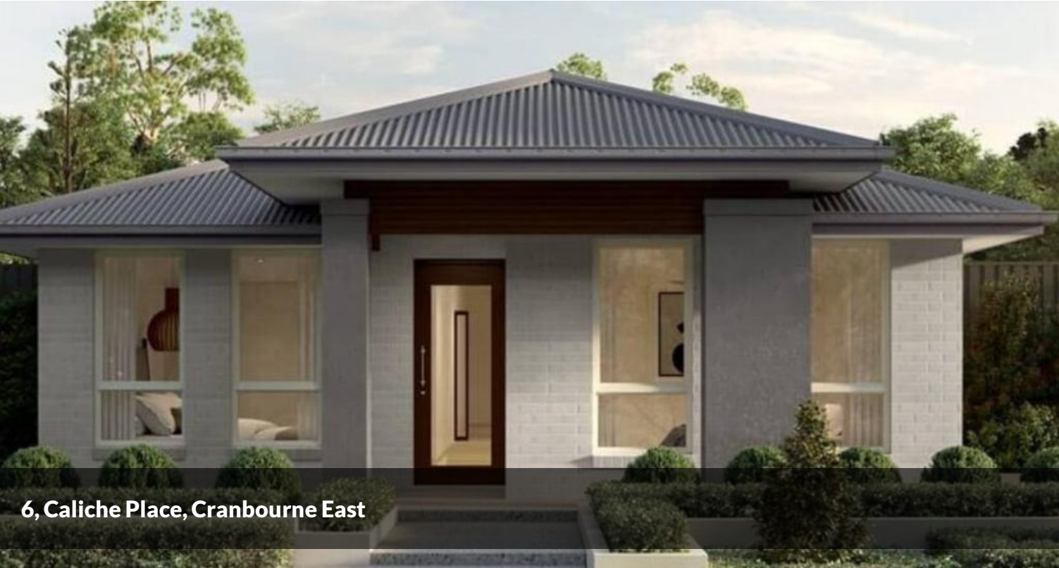
6, Caliche Place, Cranbourne East