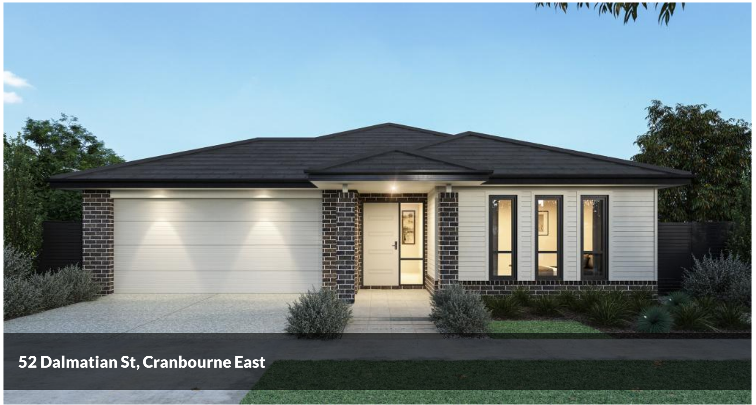
52 Dalmatian St, Cranbourne East