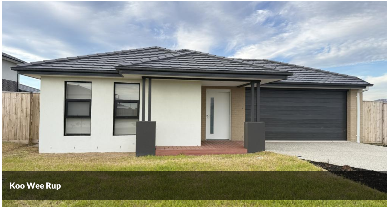
Koo Wee Rup