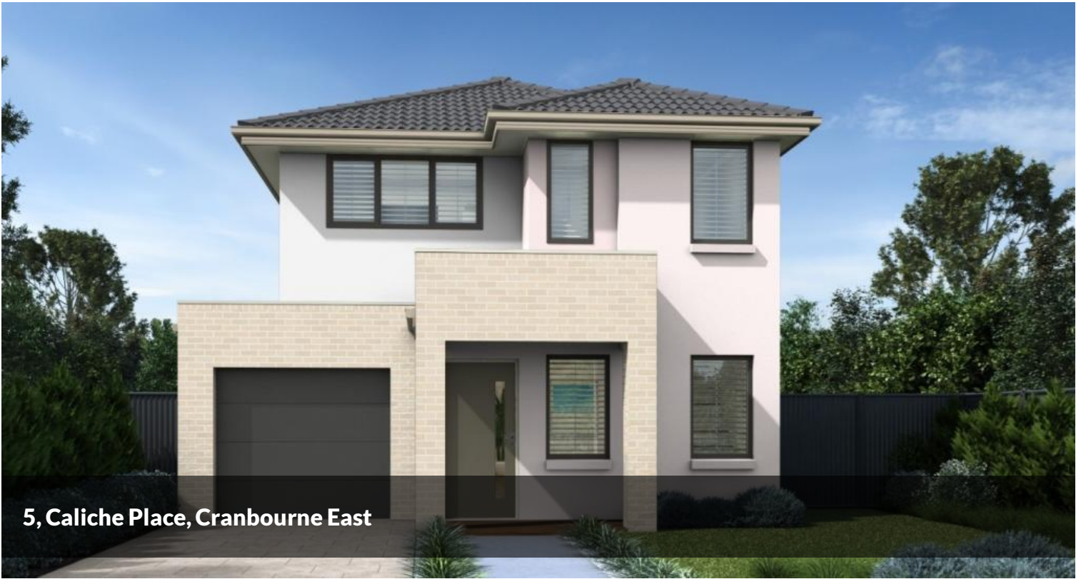
5, Caliche Place, Cranbourne East