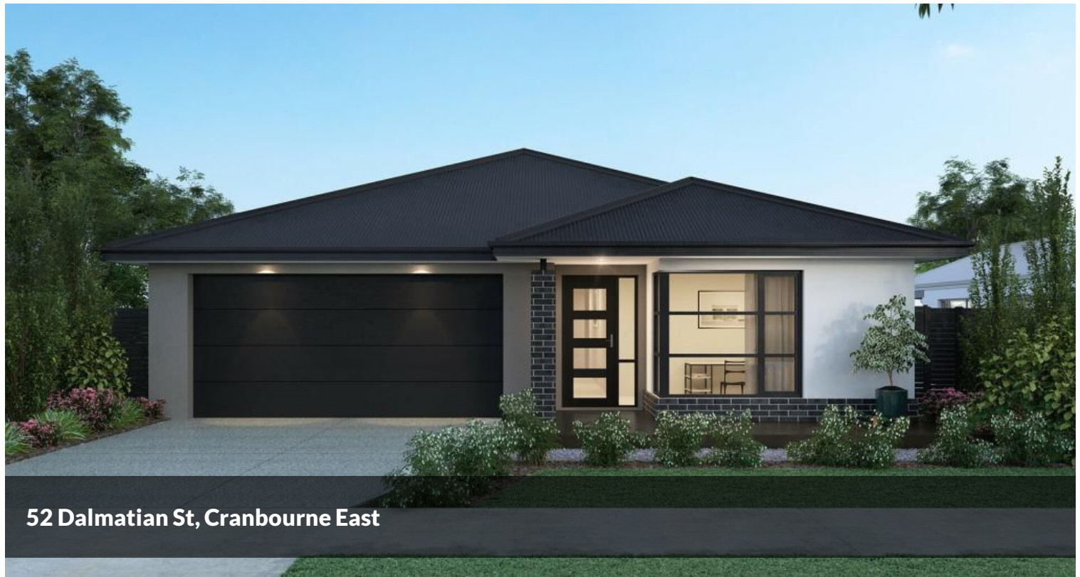
52 Dalmatian St, Cranbourne East