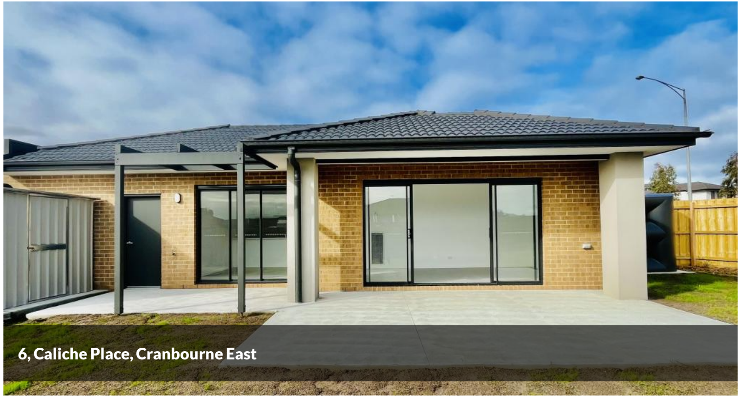
6, Caliche Place, Cranbourne East