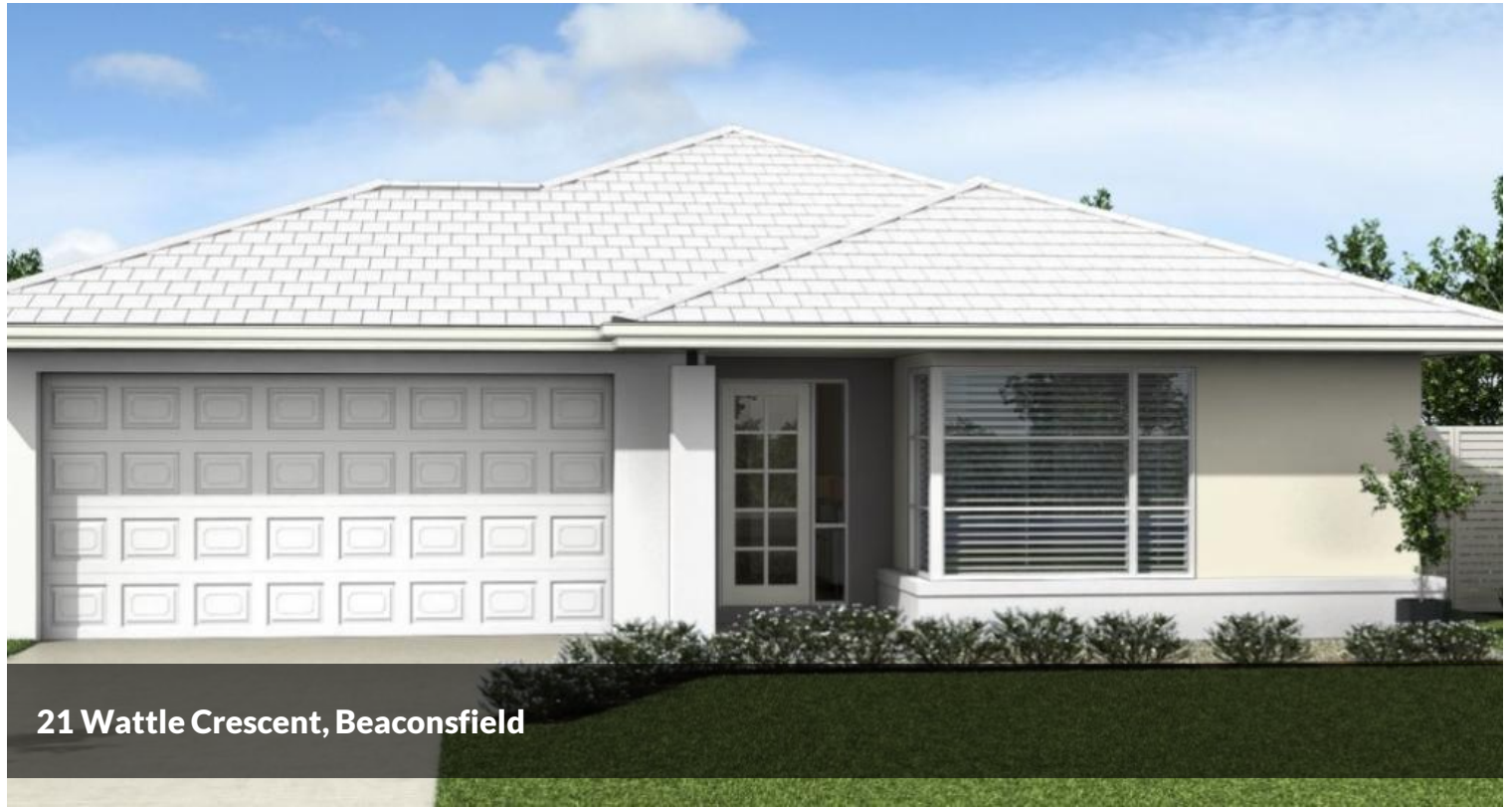
21 Wattle Crescent, Beaconsfield