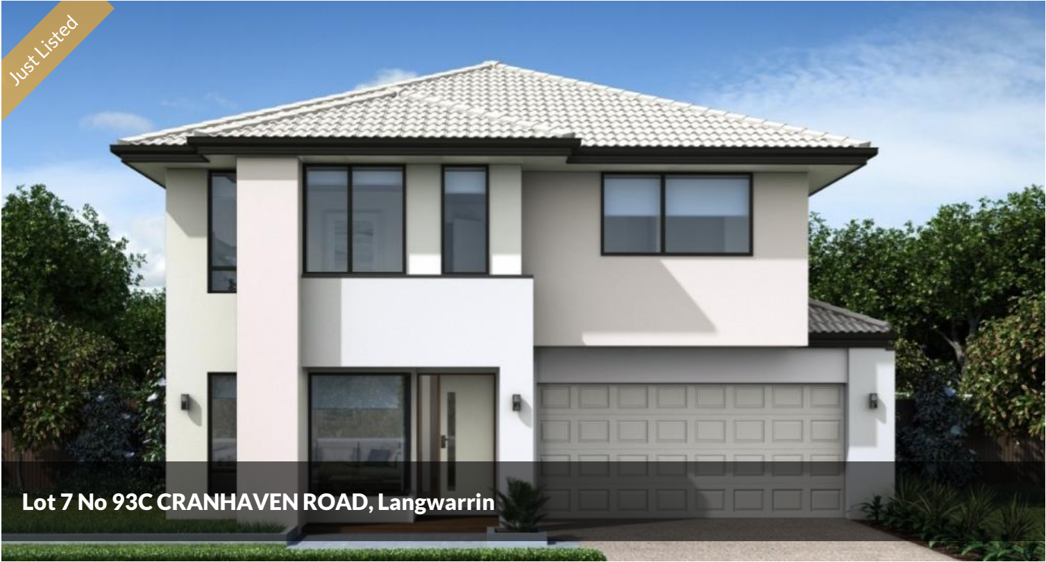
Lot 7 No 93C CRANHAVEN ROAD, Langwarrin