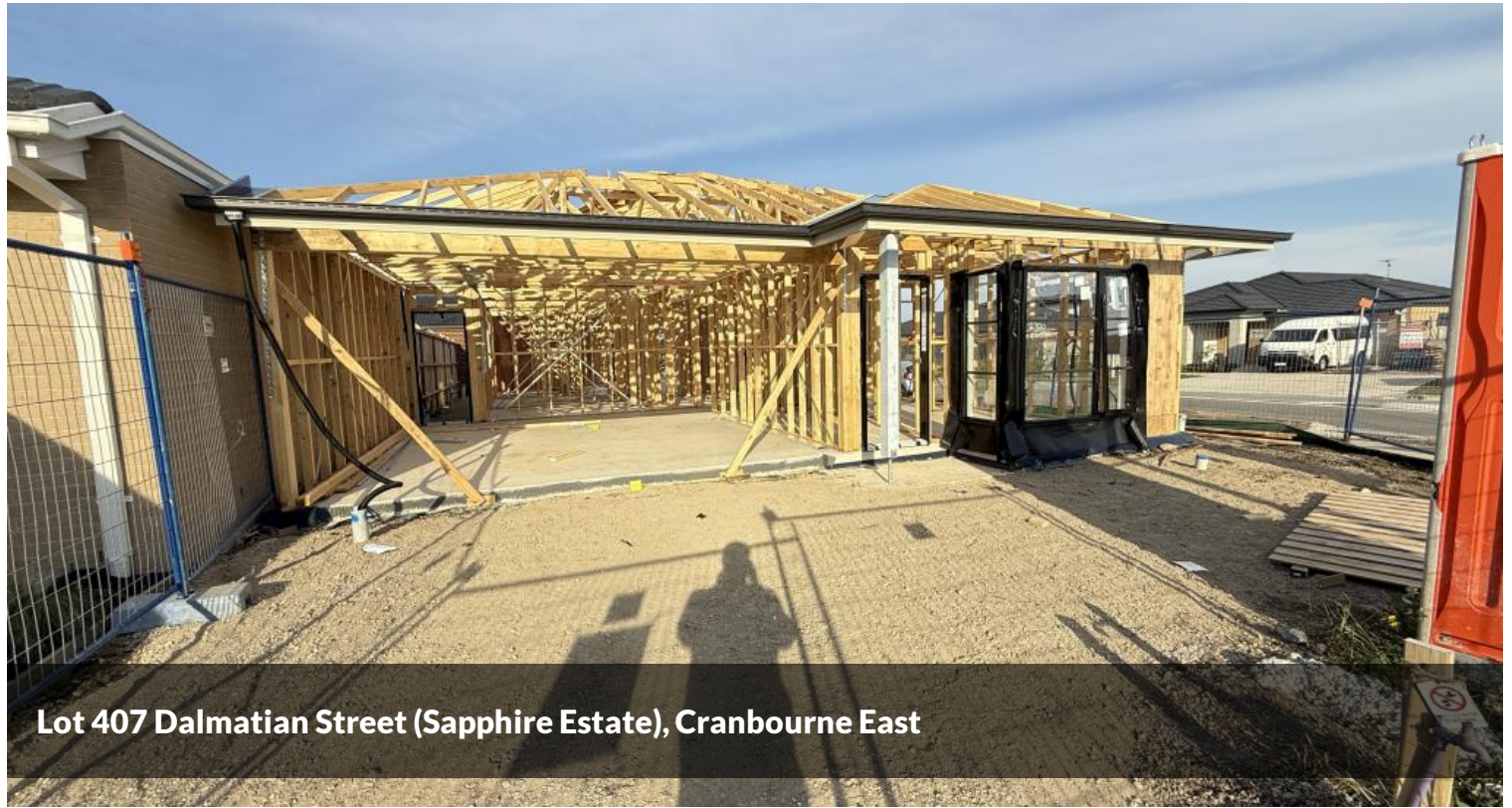
Lot 407 Dalmatian Street (Sapphire Estate), Cranbourne East