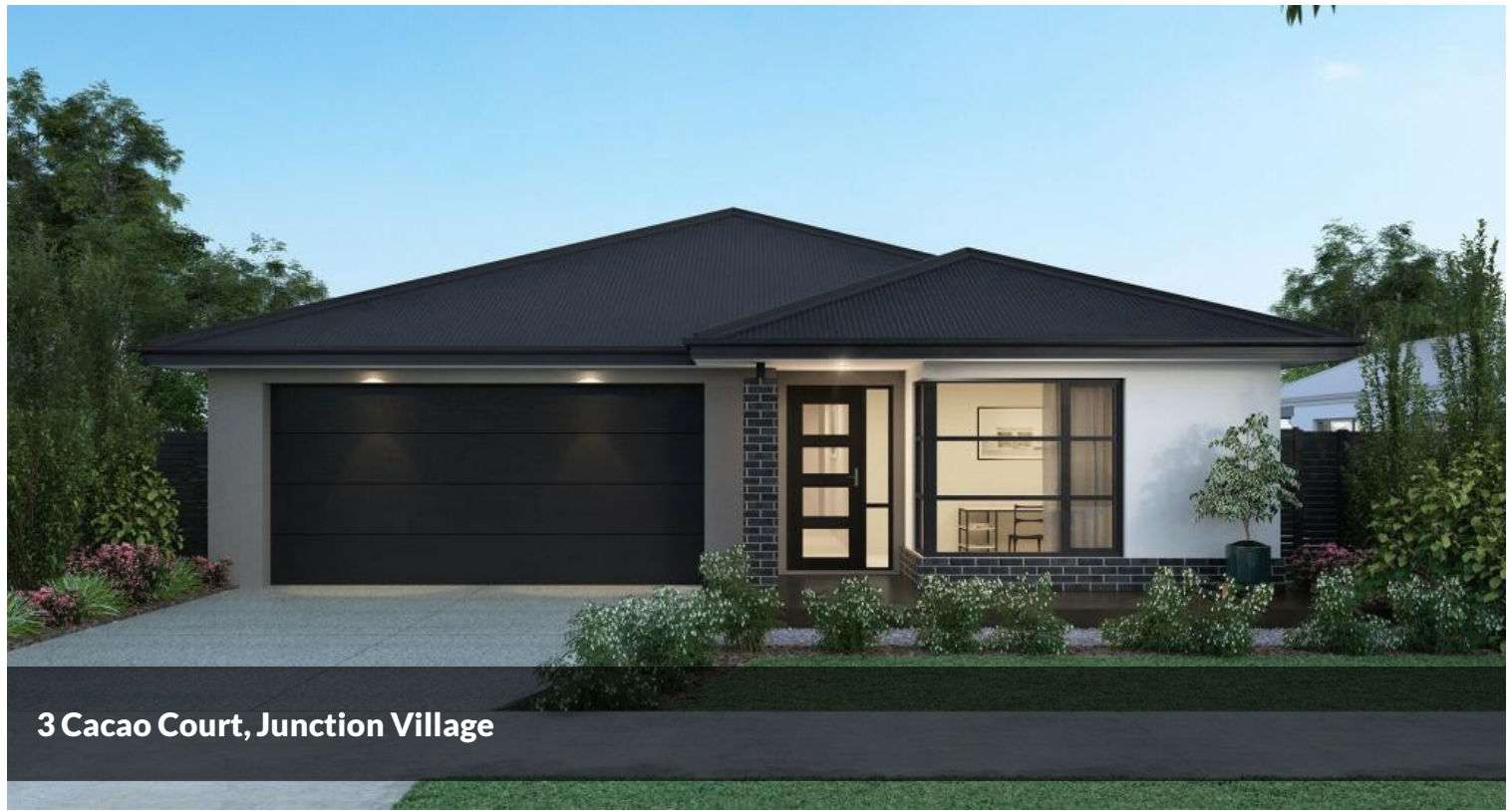
3 Cacao Court, Junction Village