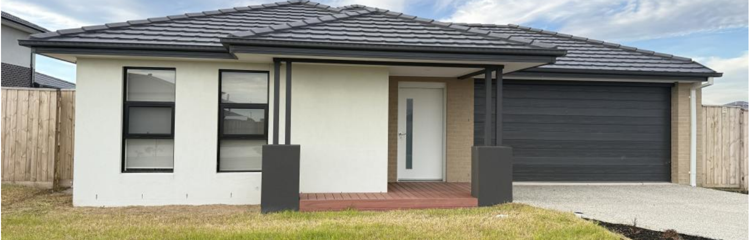
Koo Wee Rup