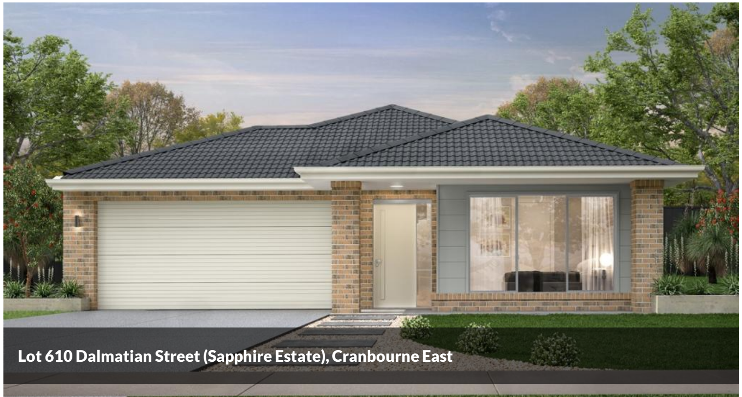
Lot 610 Dalmatian Street (Sapphire Estate), Cranbourne East