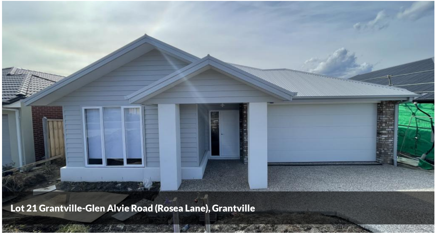
Lot 21 Grantville-Glen Alvie Road (Rosea Lane), Grantville