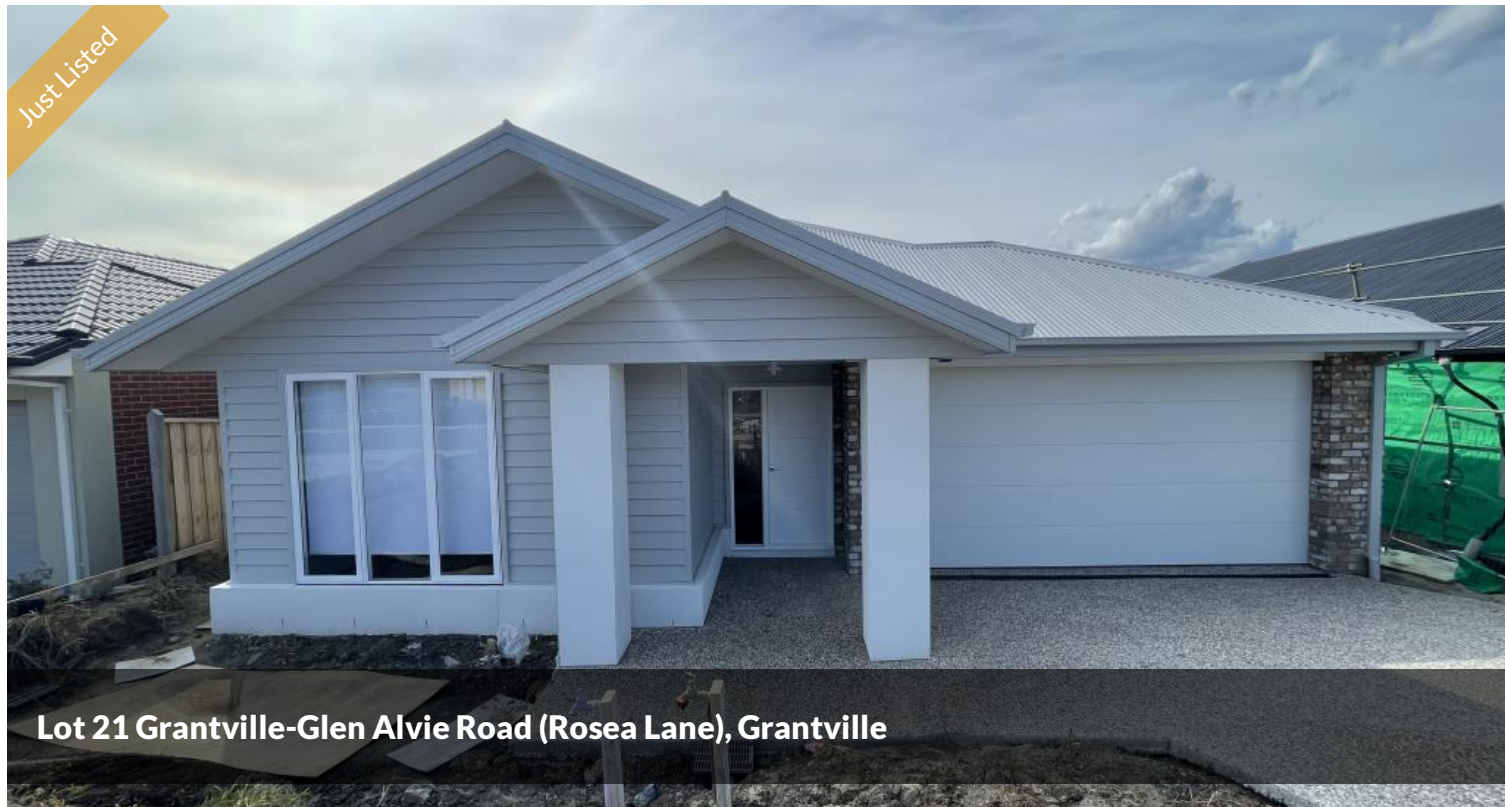
Lot 21 Grantville-Glen Alvie Road (Rosea Lane), Grantville