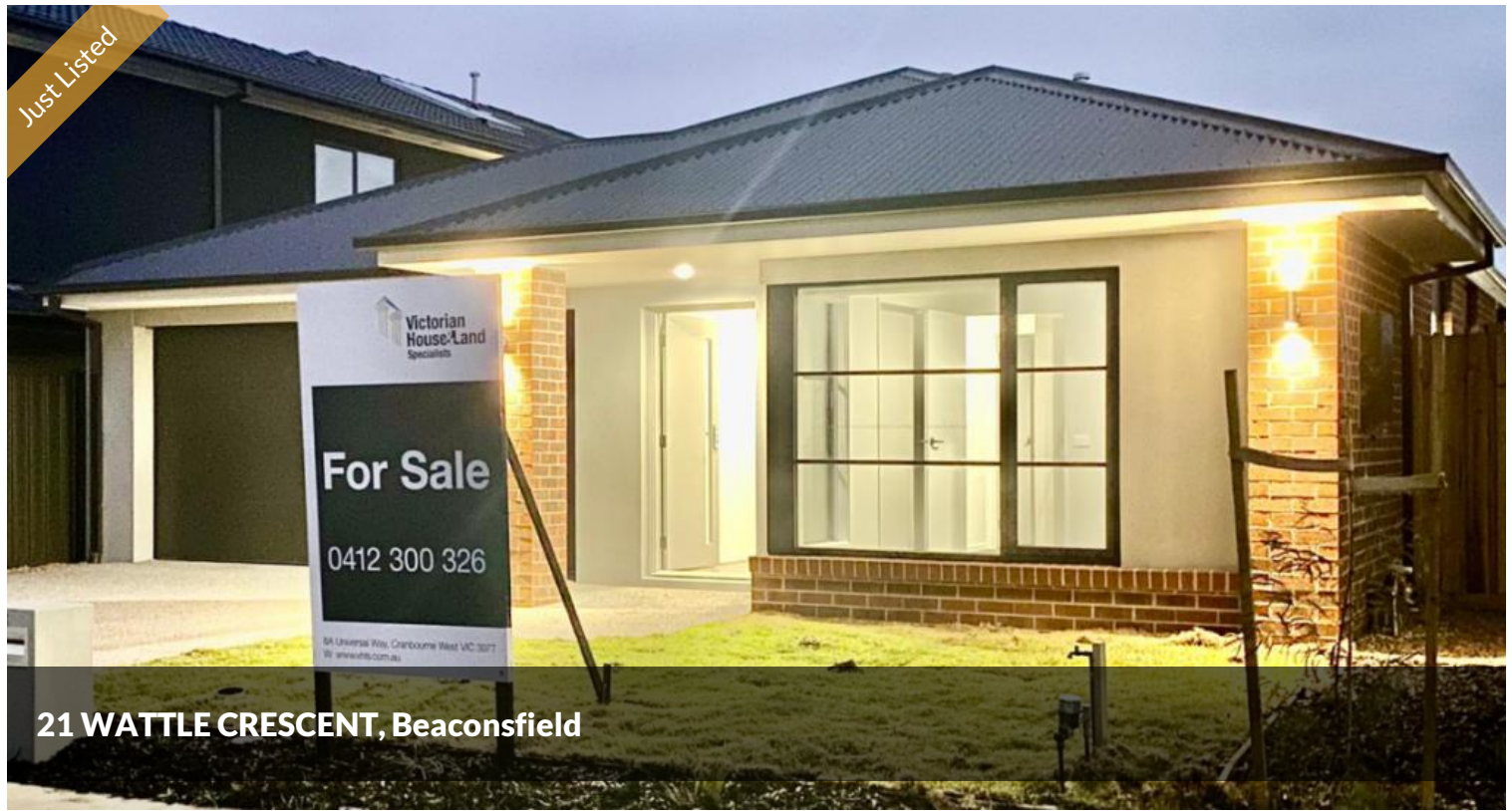
21 WATTLE CRESCENT, Beaconsfield